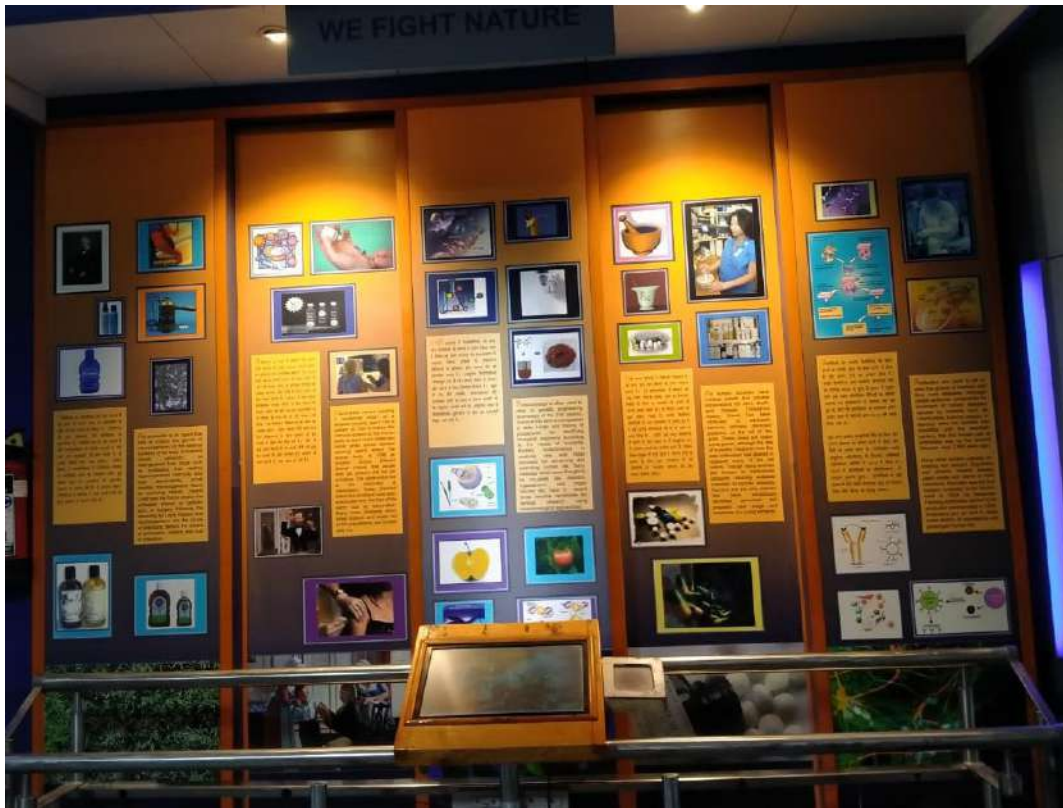
2. Another exhibit from Human Biology Gallery to show working of our Immune System in aid with medicine