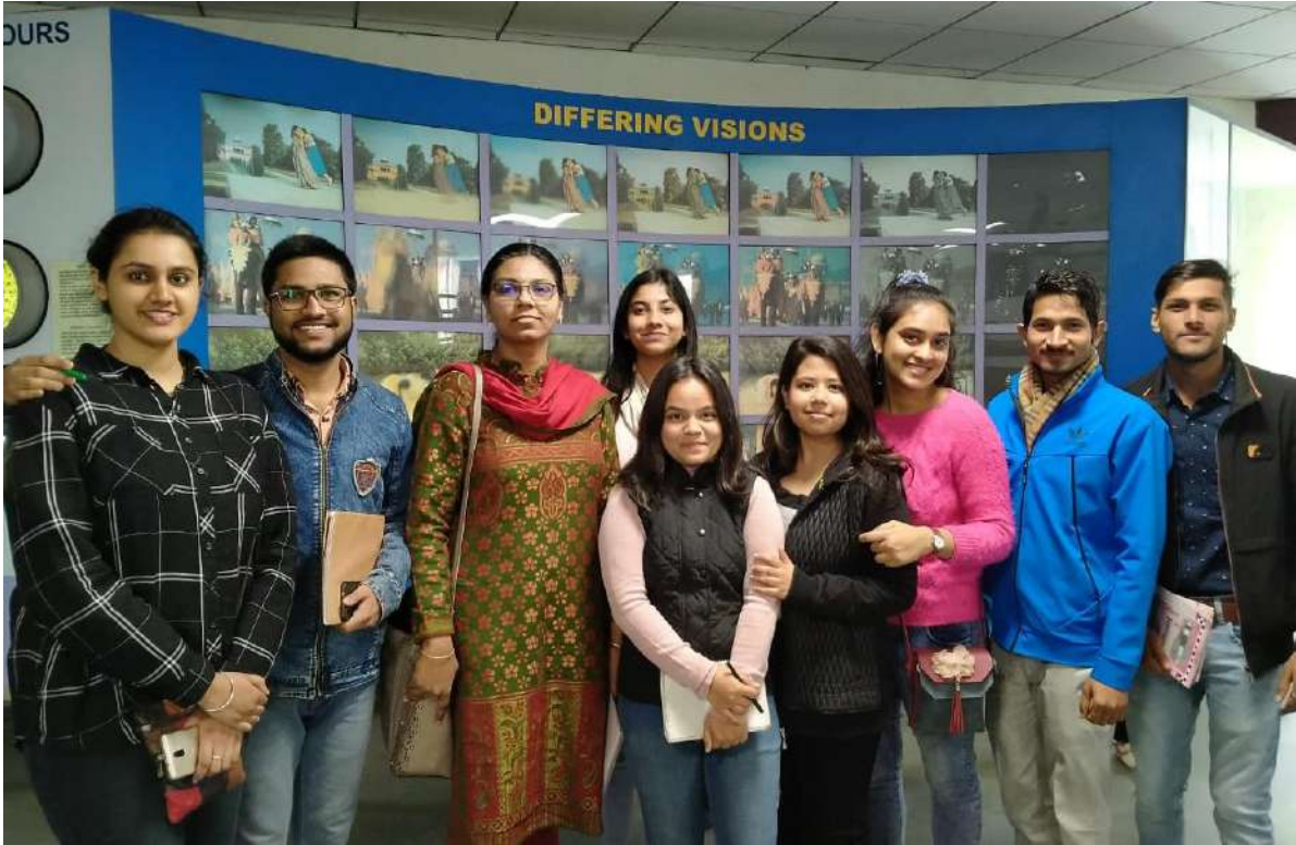
3. Students gaining knowledge about Human Vision