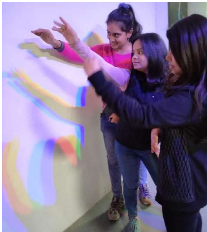
4. Students enjoying and learning the Colour Vision of Human Eye.