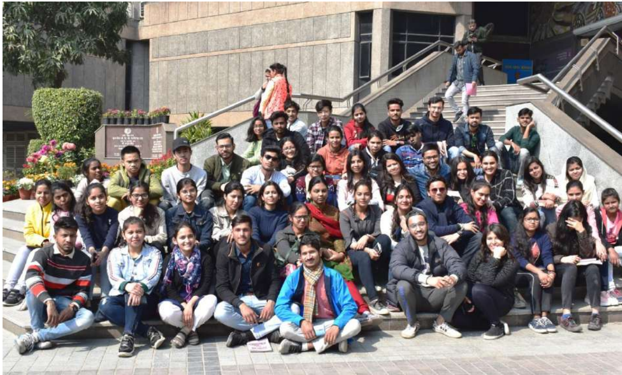
9. The enthusiastic students visiting the Centre.