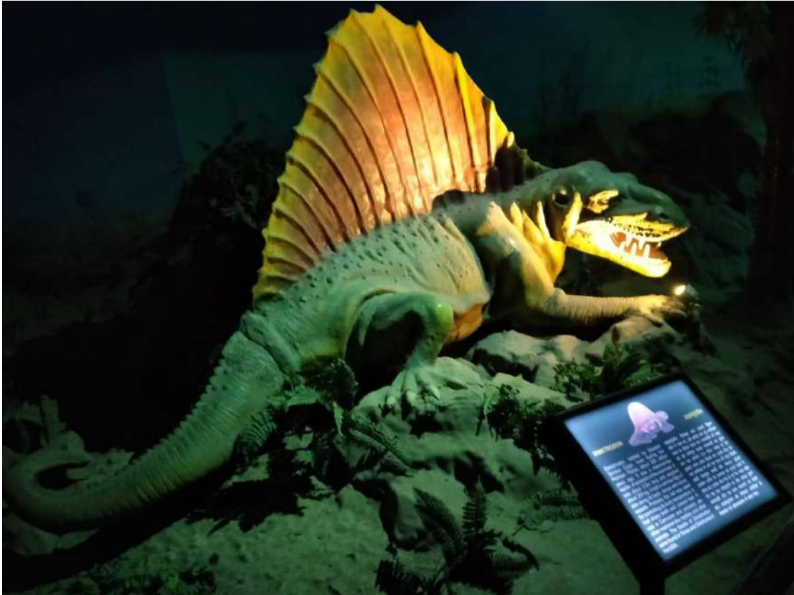
7. A exhibit of Dinosaur from Pre-historic life gallery.