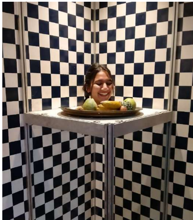
8. Fun learning ways of mirror illusions.