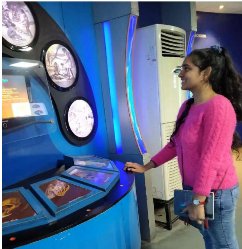
6. A student learning the basic of evolution with help of Electronic quiz in Pre-historic life gallery