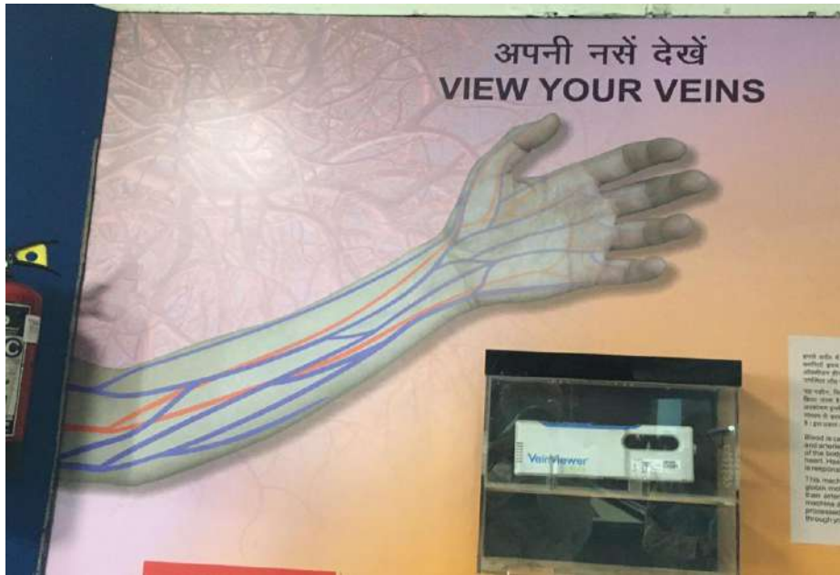
1. A electric fun game to make students aware of Circulatory System in Human Biology Gallery